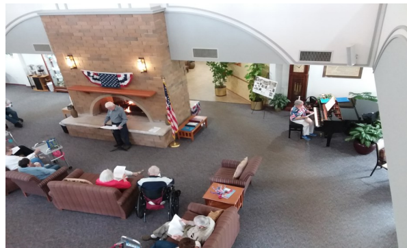
Bonnie lead everyone in song while playing the piano. Much thanks to both!