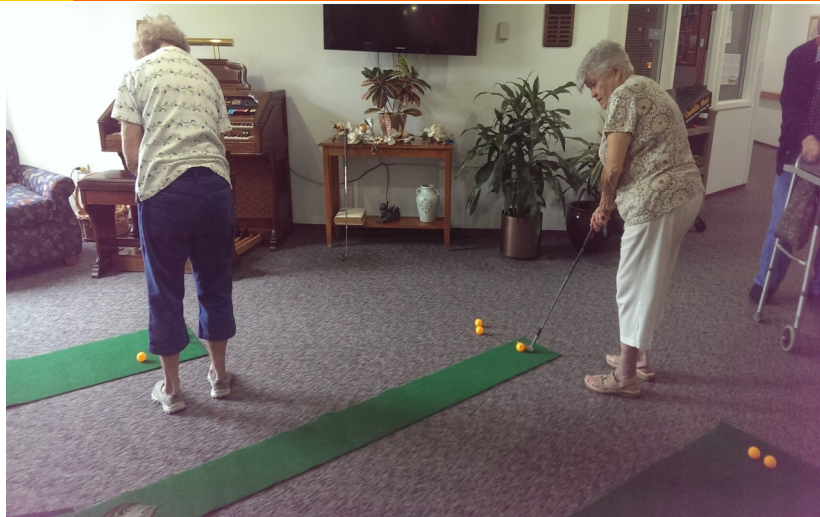
Practicing our putting skills