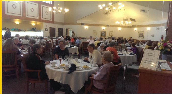
This year's Mother's Day Celebration was held in our newly remodeled dining room.