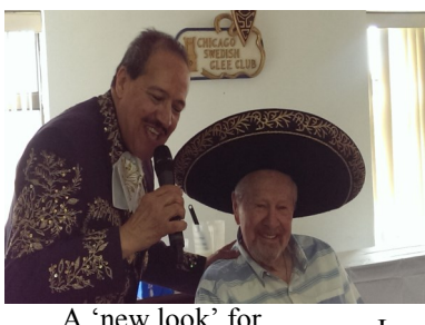
A 'new look' for you Senor!